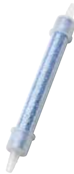
Optional Desiccant Cartridge