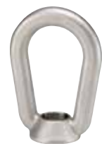
Optional Lifting Ring