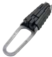
Optional Cable Clamp