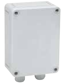
Optional Cable Junction Box