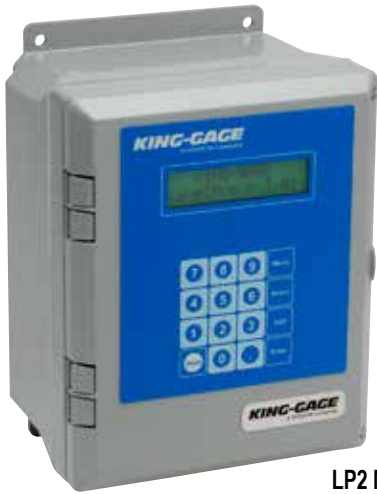
LP2 Multiple Tank Display