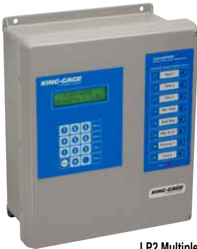
LP2 Multiple Tank Display With Optional SP Set Point Controller